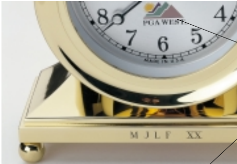
5 color logo

Most clocks can be dial imprinted in multiple colors with PMS color match. Add $65 00(G) per color one-time screen charge. Supply camera-ready art to avoid additional charge.