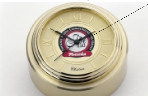
4 color logo

Custom designed by Chelsea, this imprintable Die Struck Medallion Dial features polished and gold plated roman numerals. Dial available on clocks with inset movements only.