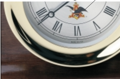
5 color logo